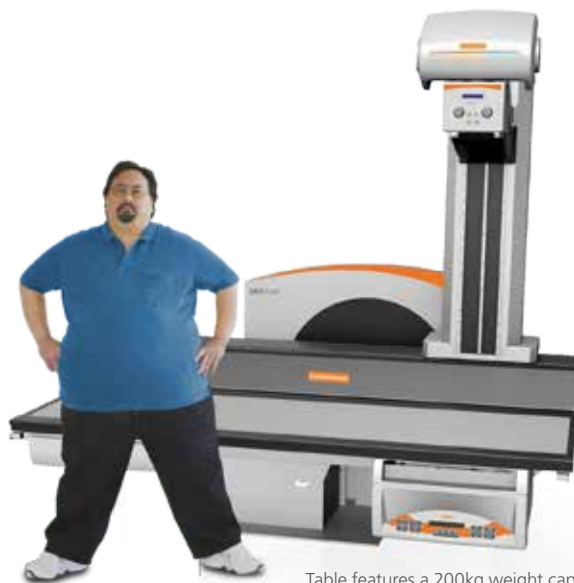
Table features a 200kg weight capacity to accommodate heavier patients.

Image-stitching station combines multiple images into one for easier reading of spine and lower-limb exams.