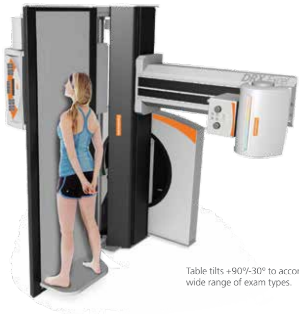
Table tilts +90°/-30° to accommodate a wide range of exam types.

The DRX-Excel offers an advanced, remote-controlled table with exceptional flexibility for a wide range of applications. Its ergonomics and efficiency optimize the entire examination process – with convenience for the operator and a low-stress, comfortable experience for the patient.