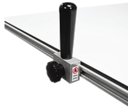
Table-side patient handgrips