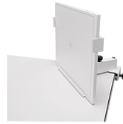
Lateral cassette holder