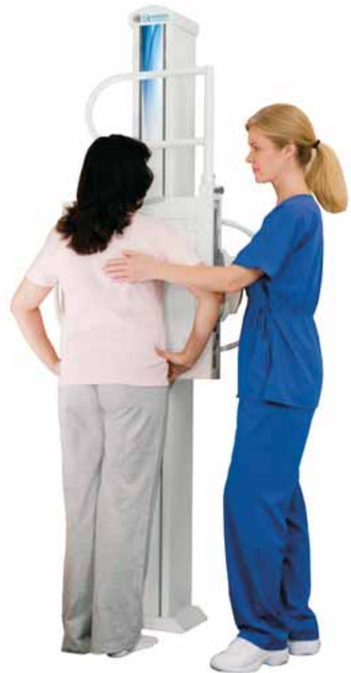
Shown Vertical Wall Stand (VERTI-Q)

Quantum’s Vertical Wall Stand, VERTI-Q, allows for a variety of imaging: from skull through lower extremities, with its counter balanced travel and minimum focal spot-to-floor distance.