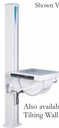
Also available as a QW-420-TD Tilting Wall Stand.