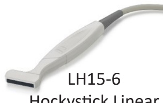
LH15-6 Hockystick Linear