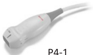
P4-1 Phased Cardiac