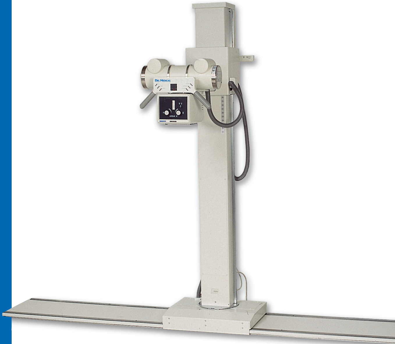
Floor Mounted Tube Stand