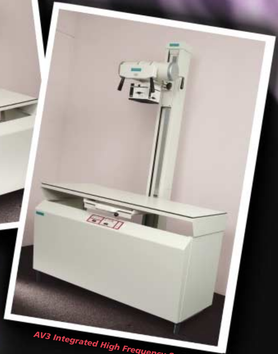
AV3 Integrated High Frequency System